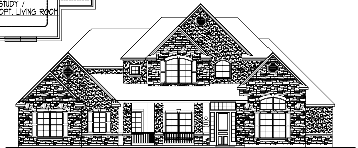
1 FRONT ELEVATION SCALE: 1/8"=1'-0"