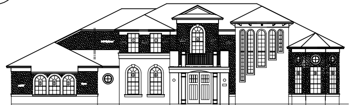
① FRONT ELEVATION SCALE: 1/8"=1'-0"